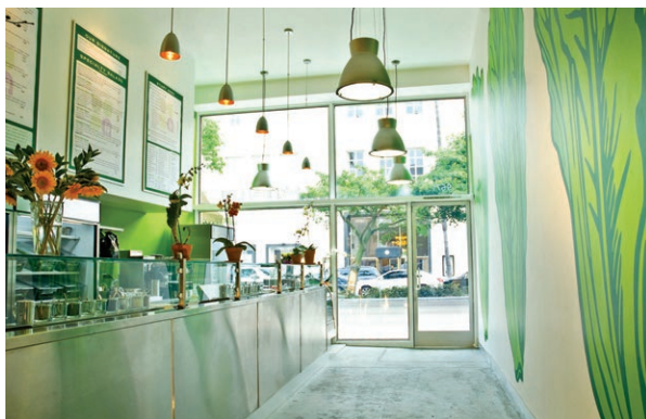
BITE CLUB From top: M Café de Chaya on Melrose; Bev Hills' Greenleaf Gourmet Chopshop; Leaf Cuisine in Culver City; Tender Greens' Salad in the Raw.